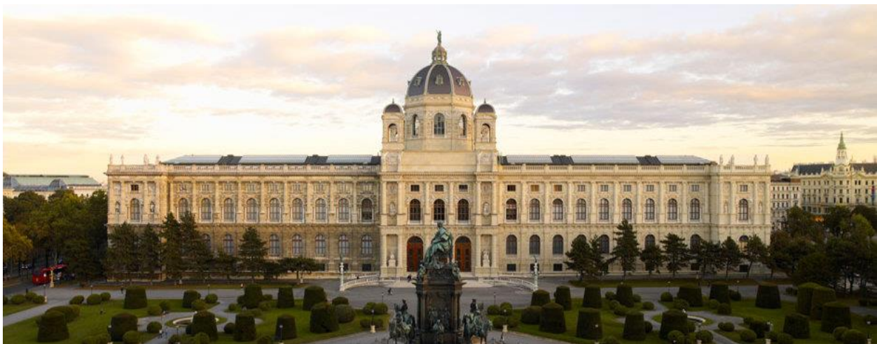
Kunsthistorisches Museum ( https://www.khm.at/ )

On Friday, 28 June, from 18:00 to 21:00, the Weltmuseum Wien is open for visitors. Around 19:00, the Museum's Department of Education will offer guided tours in English and Spanish.