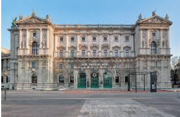
Weltmuseum Wien ( https://www.weltmuseumwien.at/ )